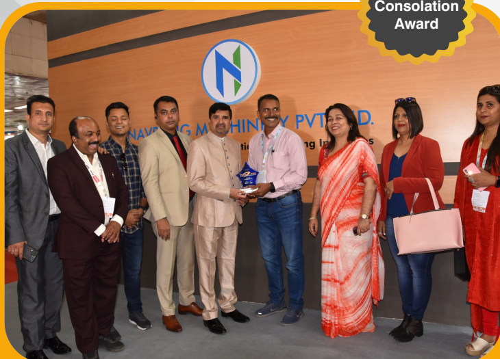
NAVRANG MACHINERY PVT. LTD.