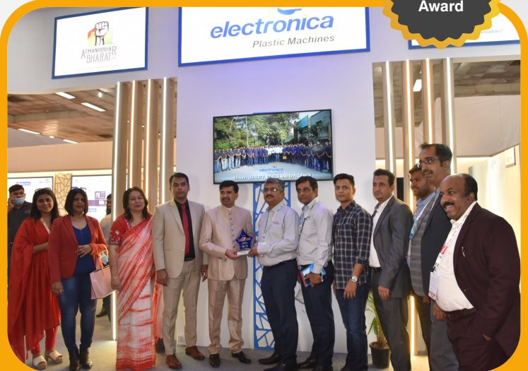
ELECTRONICA PLASTIC MACHINE LTD