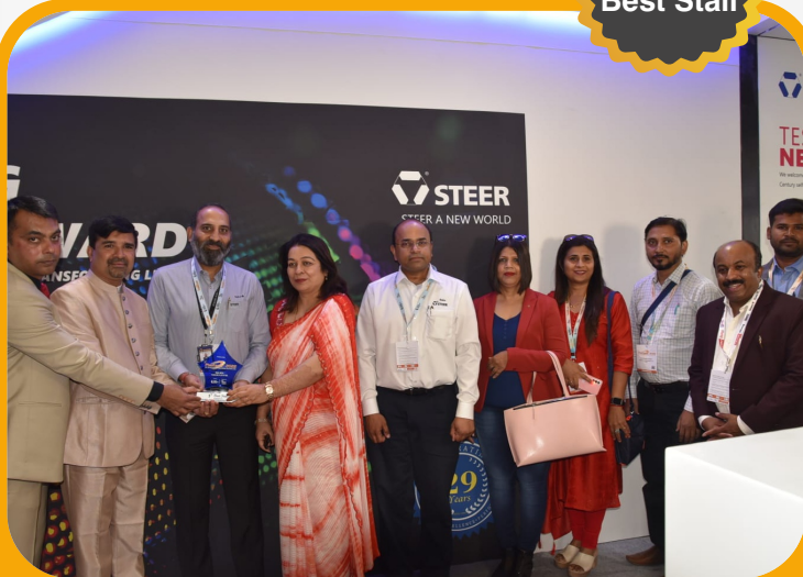
STEER ENGINEERING PVT LTD