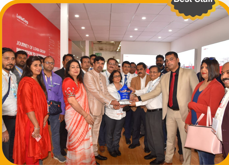
LOHIA CORP LIMITED