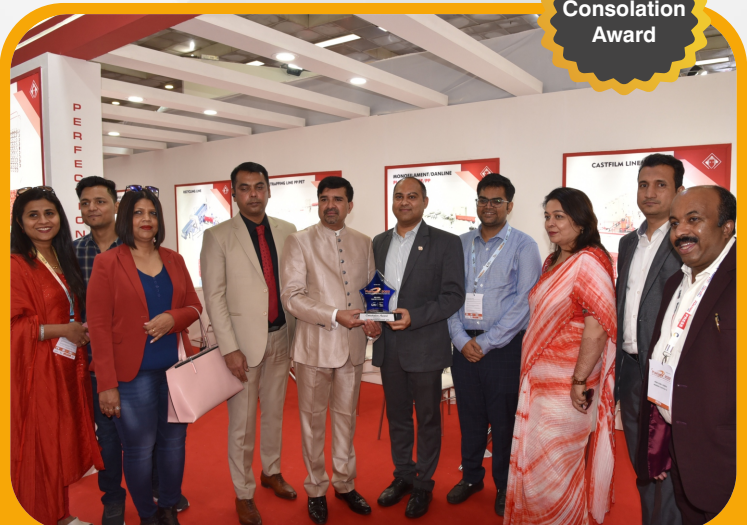
JP EXTRUSIONTECH PVT LTD